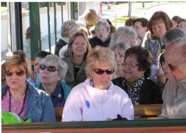
Sightseeing on the Trolley