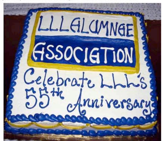
Alums celebrated with a special anniversary cake.