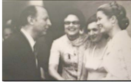
Princess Grace at 1971 LLLI Conference Photo at DePaul Exhibit

memorabilia that are stored in the university's archives were displayed in three cases.