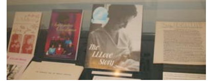
photo albums, correspondence, postcards, signed pictures of celebrities, etc. Beyond this is a larger reading room area that was set up for the reception with snacks, beverages, and chairs around of the room. From the front desk I could see back into the actual archives where all the LLL materials are kept. For this reception the black notebook listing all these materials was put out for viewing. This list, the "finding aid," is available online at http://library.depaul.edu/Collection/s/spcaPDF/LaLecheLeagueFA.pdf

DePaul University is a couple of miles from my house. When I saw the invitation to a reception for the "Mother's Milk: The Story of La Leche League" exhibit there, I made plans to attend. The archives are in a third floor room of the Richardson Library at DePaul. When you enter the room you see the glass exhibition cases full of LLL memorabilia — early conference programs, booklets,