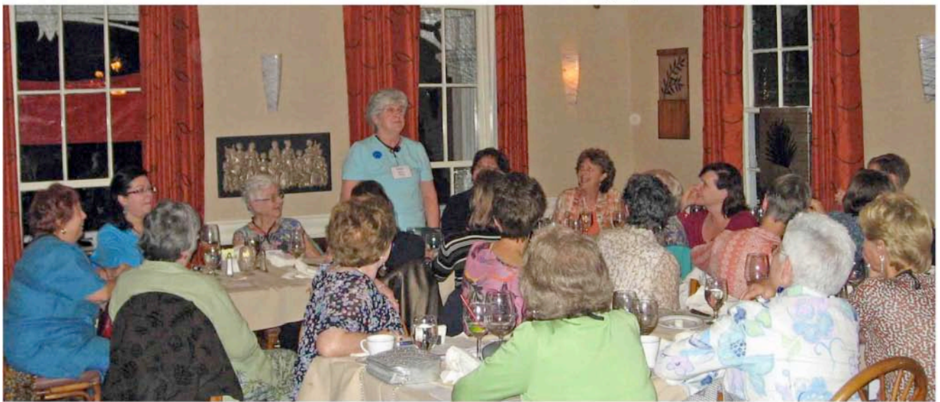
Getting to know what makes Alums happy at group dinner: highlighted by everyone's interests, jobs, and fun activities.