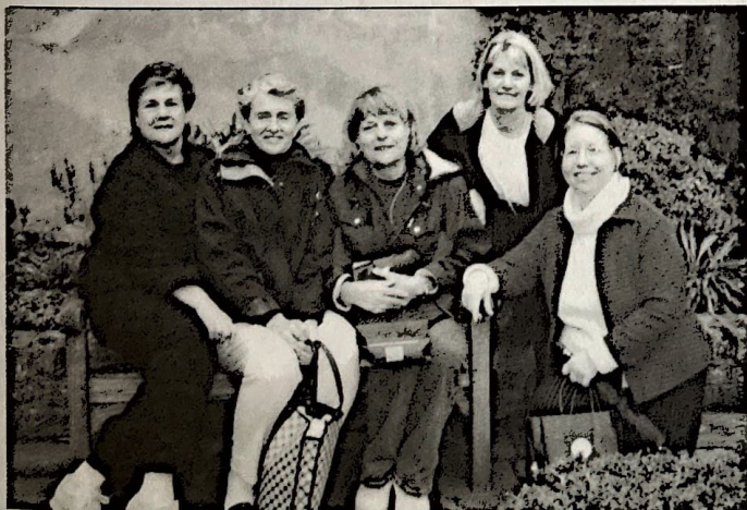
A group of WIT members on the Alumnae-sponsored Savannah trip.

When we first started meeting on a monthly basis, we discussed parenting and self help books. We supported and encouraged each other in handling the challenges of raising our children. We have been there for each other when our children have done great things and when they made poor choices. We joke that our children have ten mothers.